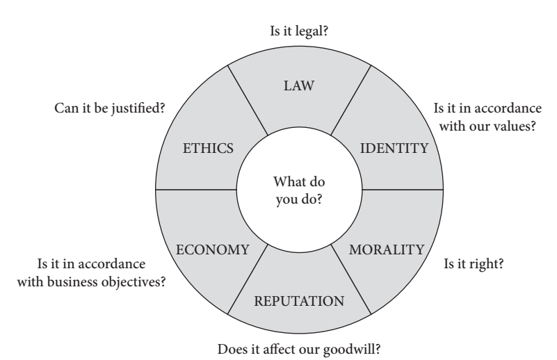
FIGURE 6.1 The Navigation Wheel

This chapter adds to the decision-makers toolbox by introducing the Navigation Wheel, a figure designed by Einar Øverenget and myself (Kvalnes and Øverenget, 2012) to be the central component in ethics training in organizations. We have applied the Navigation Wheel in ethics seminars and courses in a range of different organizations, in the private and the public sectors, and in organizations of different shapes and sizes. The formative idea has been to supply the participants with a simple tool to use in practical settings where they face moral dilemmas and other challenging decision-situations: