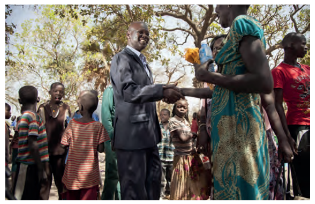
MP and public dialogue in Wulu, South Sudan, February 2013.

In South Sudan, WWS has supported national civil society engagement with the government and other duty bearers through efforts to build trust and understanding between the two: working with the state on constitutional matters, lobbying for change and encouraging citizen involvement in governance.