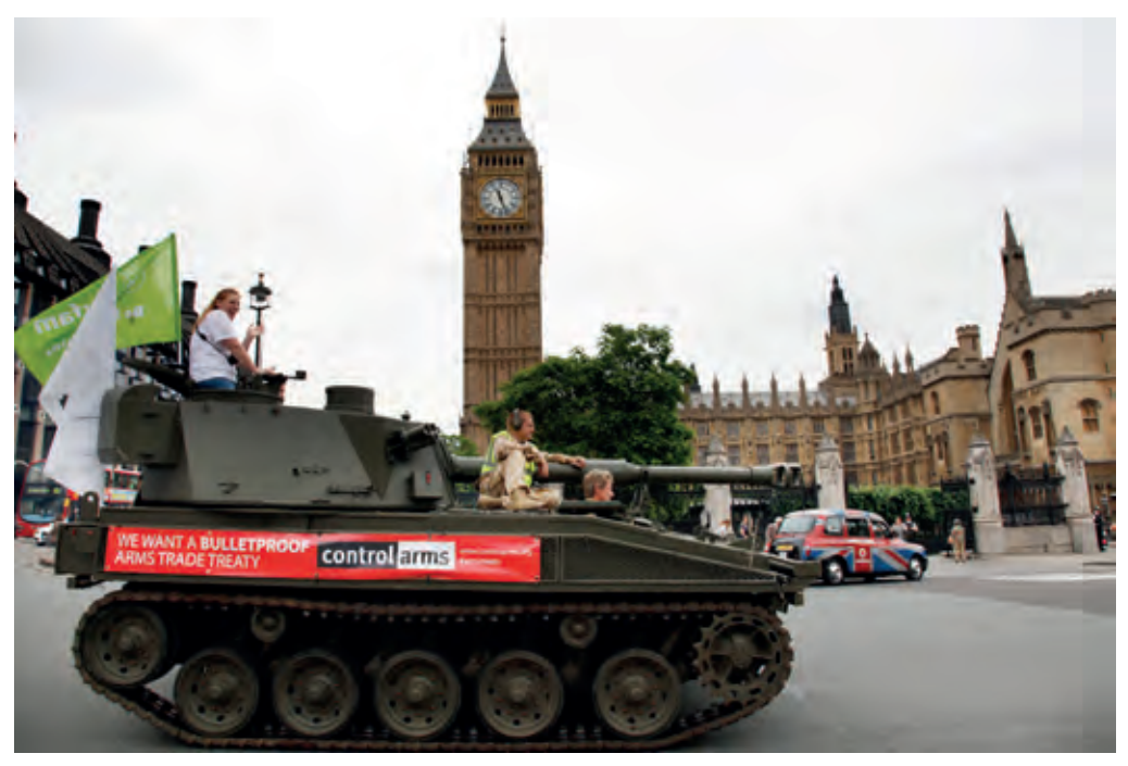
Arms control campaigners take an armoured tank through the streets of London (June 2012) to call for an Arms Trade Treaty.

In April 2013, Oxfam and its allies in the Control Arms Coalition celebrated a fantastic campaign achievement with the adoption of the Arms Trade Treaty (ATT) by an overwhelming majority at the UN General Assembly. By September 2014 over 50 states had ratified the Treaty, triggering its entry into force on 24 December 2014.