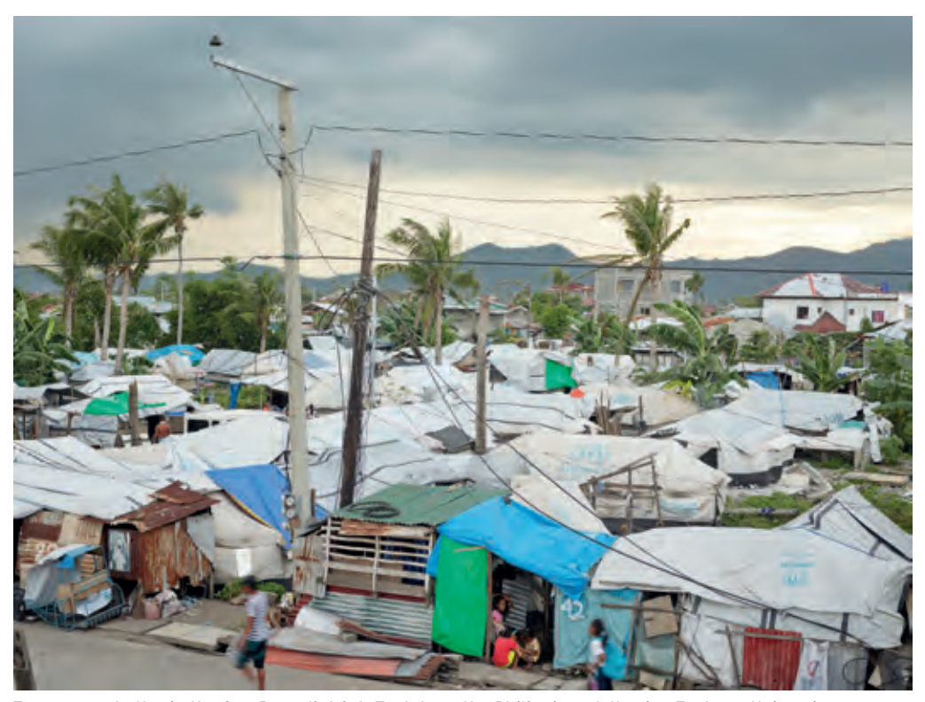
Temporary shelter in the San Jose district, Tacloban, the Philippines following Typhoon Haiyan in September 2014.

After Typhoon Haiyan struck the Philippines in November 2013, the City of Tacloban was one of the most devastated areas. UNHCR distributed tents as an immediate response to address the shelter needs of affected families. This led to the emergence of numerous 'tent cities' along roads, in vacant lots and where homes once stood.