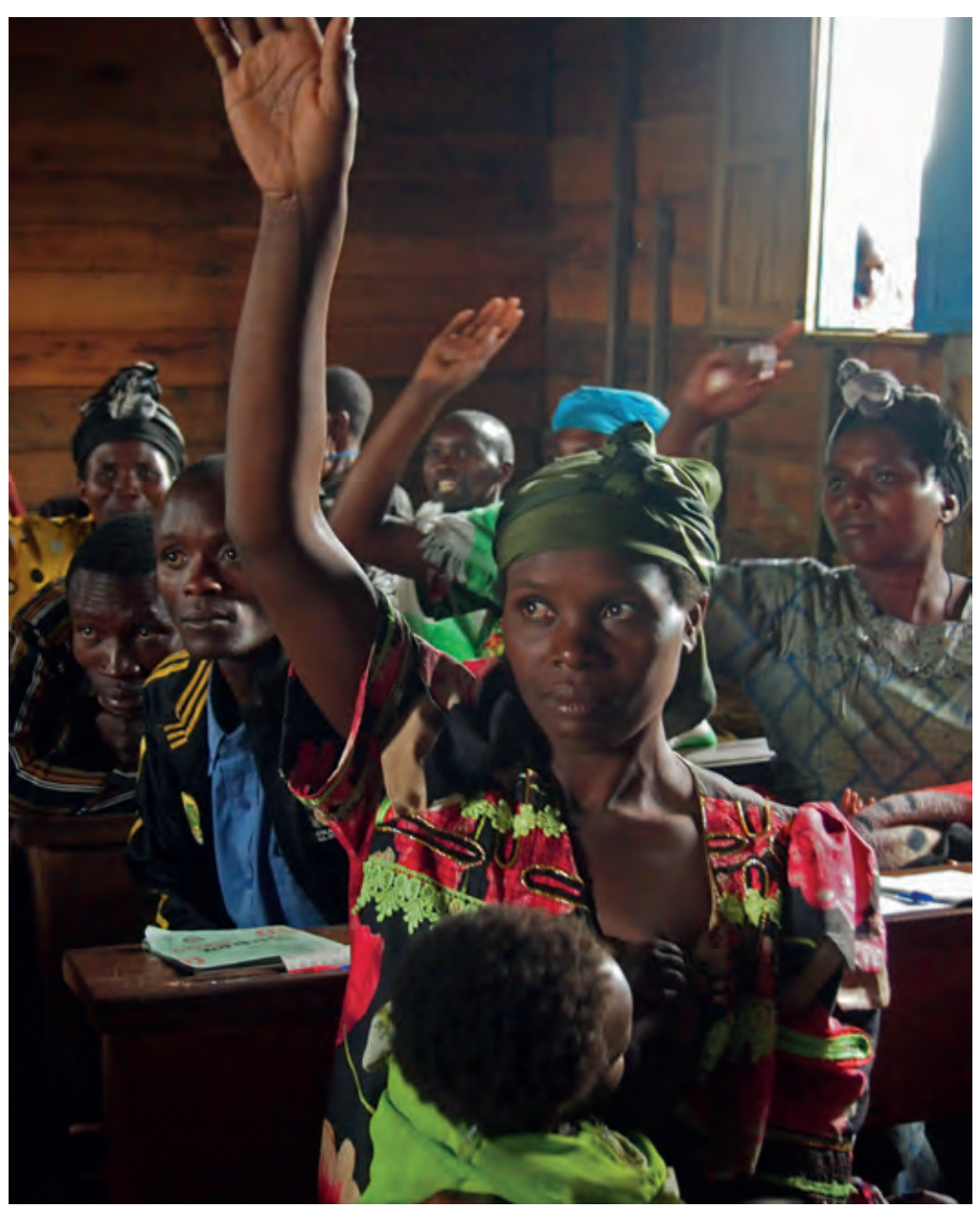
Men and women pay close attention in a training session in Mpati camp, DRC in February 2012. The Oxfam protection team is running a training session for members of village protection committees and "agents du changement" (change agents).

As well as influencing the mandate of peacekeeping operations at the Security Council level, organizations such as Oxfam can advocate for protection to be prioritized in Rules of Engagement, and hold peacekeepers to account for implementing these. Oxfam has worked to influence peacekeeping missions to better protect civilians in DRC, Sudan, South Sudan, Central African Republic, Chad and elsewhere. A recurrent focus of this advocacy has been improving the responsiveness of peacekeeping missions to communities' own protection concerns, through better engagement with the people they are mandated to protect.84