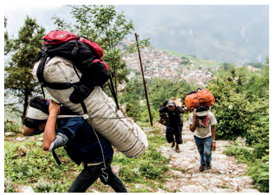
Thirty six porters hired by Oxfam deliver relief material by foot to the remote village of Laprak, Gorkha District, Nepal. The road is inaccessible due to landslides following the April 2015 earthquake.