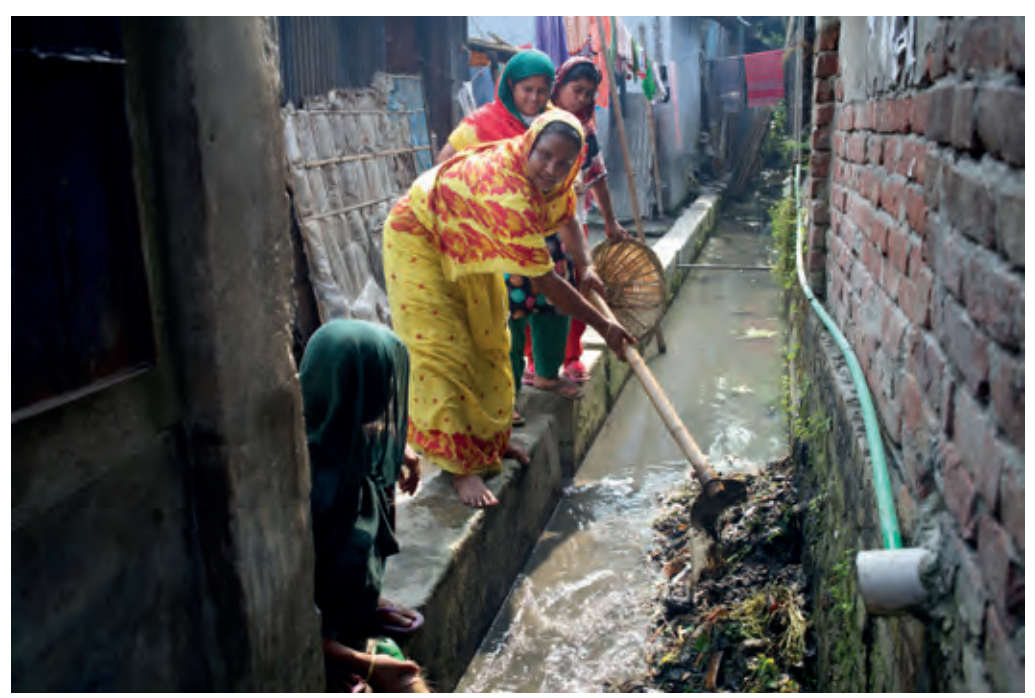
Residents from the 40 Bari Colony community, Bangladesh participate in a drain clearing rally in November 2014. Volunteers are mobilizing the community into cleaning away household waste which currently ends up in drains causing water-logging and localized flooding.

Building resilience, reducing the risk of disasters and adapting to climate change are urgent humanitarian priorities – with increasing hazards (due to climate variability and other factors), increasing exposure of people to risk (as populations grow and concentrate in high-risk areas) and high levels of vulnerability among the poorest people.