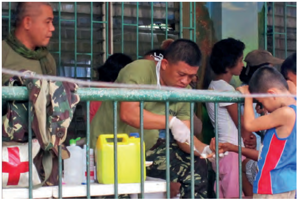
The military provide first aid to evacuees in the Philippines following flash floods in December 2011.

The UN Security Council often also mandates peacekeeping forces to perform tasks proximate or directly relevant to humanitarian assistance – such as supporting humanitarian access, the protection of civilians and maintenance of security around refugee camps and other places of aid distribution (see <a href="section 4.2.3">section 4.2.3</a> on protection and peacekeeping). The presence of multiple military forces in an emergency context can create a fraught situation, and requires careful coordination and management under civilian-led control.